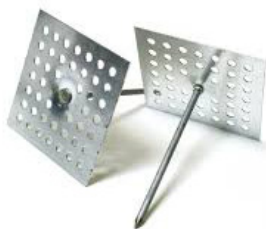
Pin Style Insulation Anchors

Premier 100% Polyester Carpark & Soffit insulation panels are recommended to be installed using mechanical fixings. These can be either shot fired insulation anchors (such as Hilti or Ramset) or the insulation pin style insulation anchors with one-way washers or domes.